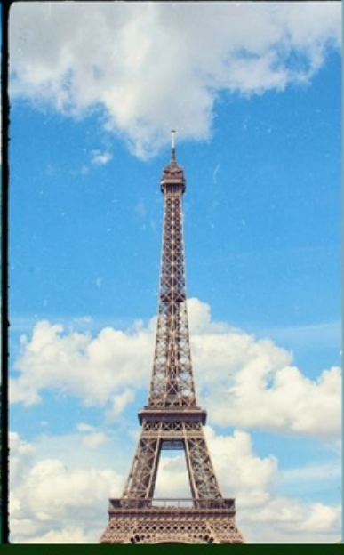
EUROPEAN DELIGHTS 9N/10D LKR 1,150,000