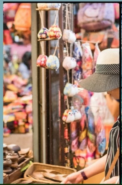
BANGKOK SHOPPING 3N/4D LKR 230,000