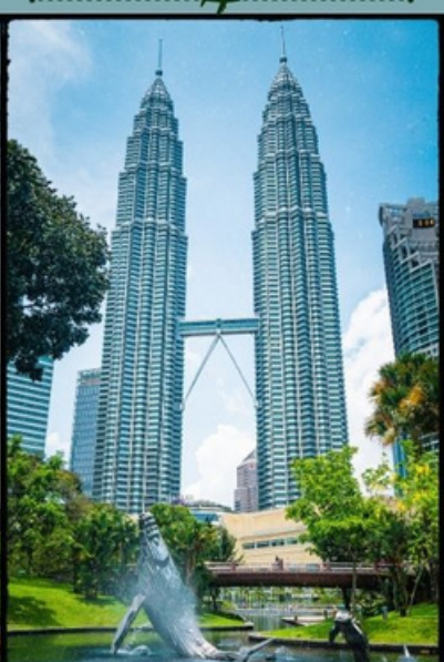
MALAYSIA 4N/5D LKR 250,000