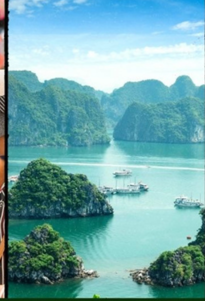
VIETNAM ODYSSEY 6N/7D LKR 579,000